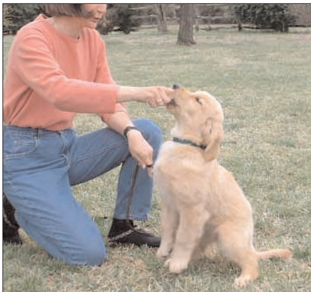
Photo 2: Cinda sits for the treat. The treat is a bit too high, as her front feet come off the ground to try to get it from me.

(10-15 feet) around the house or yard, or whenever you are in a situation where he might not allow you to catch him. First, this will allow him to grow accustomed to being on a leash, and it will also afford you the ability to catch him if he starts to run from you.