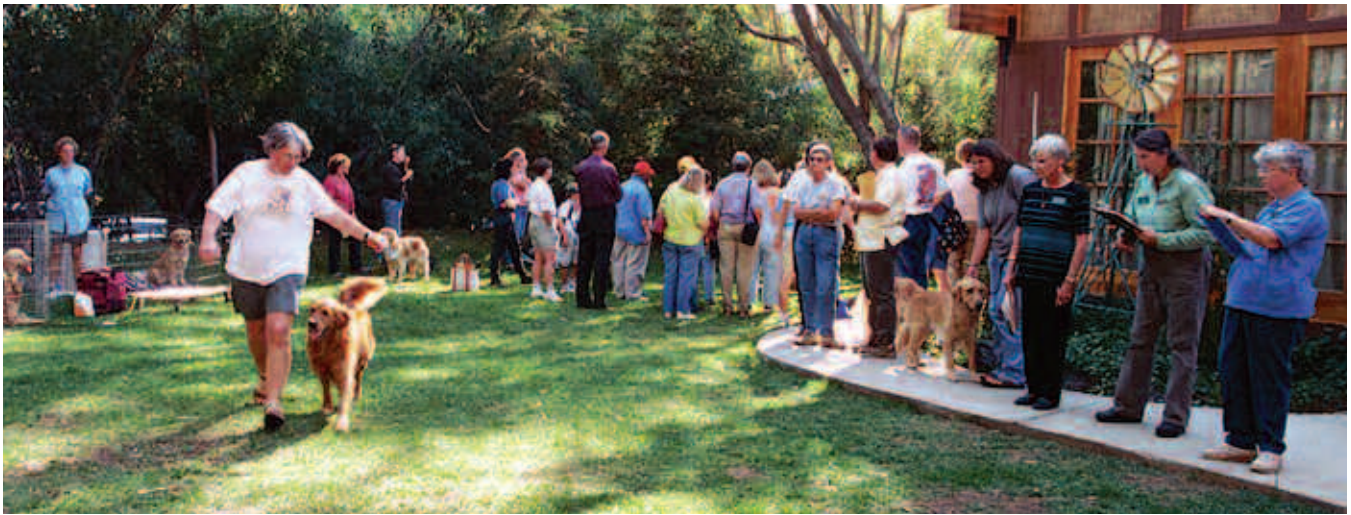
A handler gaits her Golden as the three judges (at right) watch and evaluate the dog.

Why, then, is the GRCA program so significant? Because GRCA “has the numbers,” being the world’s largest single breed club, with almost 6,000 members! BSS has 2,400; while VCA has 850; and LRC has 650. Thus, GRCA has increased the number of people aware of these CC programs by over 150 percent.