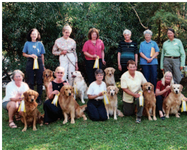
Here are the eight successful Golden retrievers with their owners. The three judges are in the second row on the right.

grams for all sporting breeds. For both AKC and UKC these programs have been the fastest growing (and most lucrative) in their long histories. In Canada, during that period, CKC initiated similar non-competitive hunting test programs for retrievers and spaniels. Of course, we shouldn't forget that, way back in the late 1960s, NAVHDA began conducting its highly respected non-competitive tests for versatile (pointing) breeds.